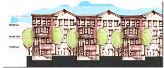
East Orange, NJ

The process involved researching local city agencies records and databases, field investigation on a lot-by-lot bases and establishing area investigating methodologies to properly determine the state of the Lower Main Street Phase II Area.