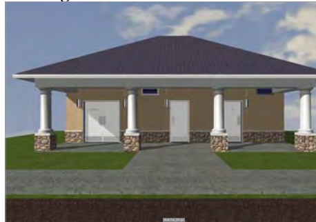
Restroom Front Façade Facility