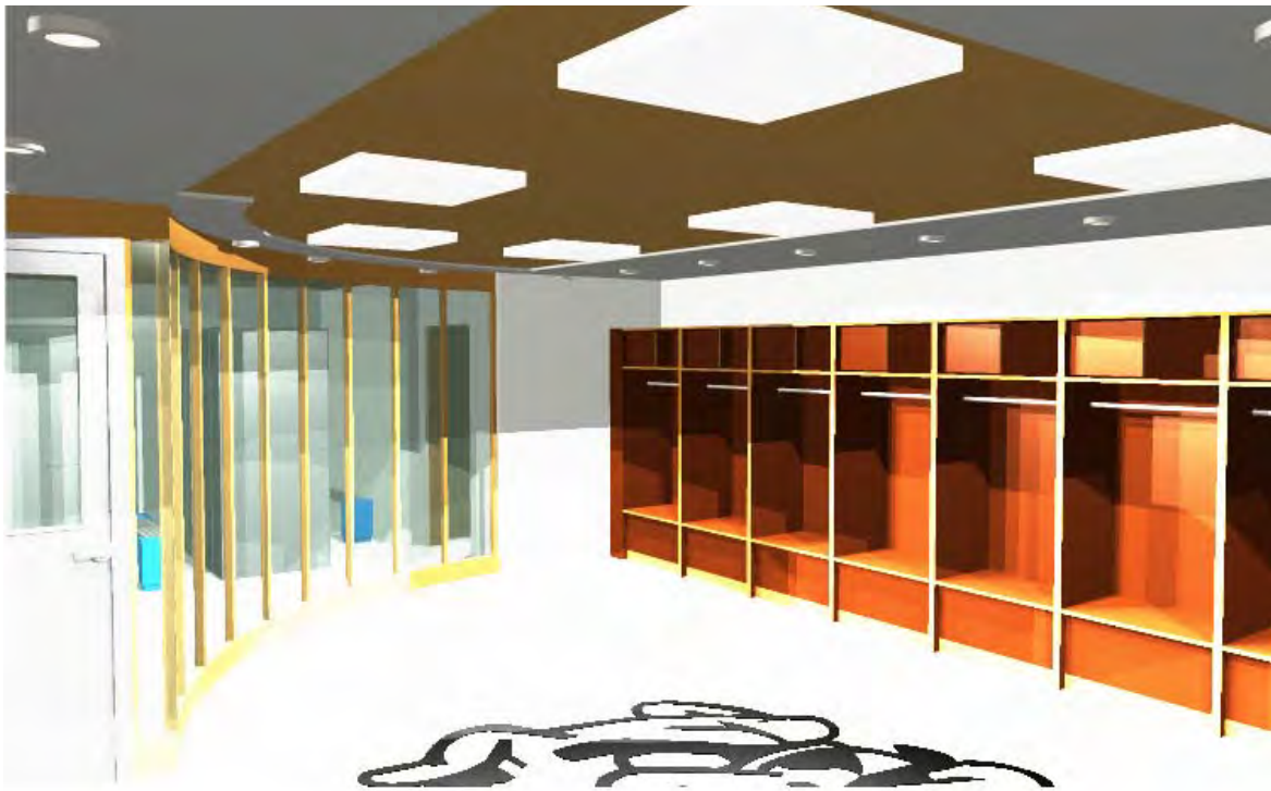
New Design and Built Locker Room