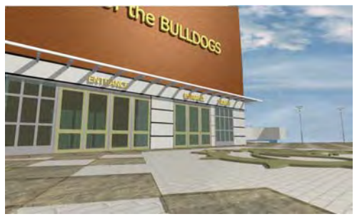
New Gymnasium Entrance