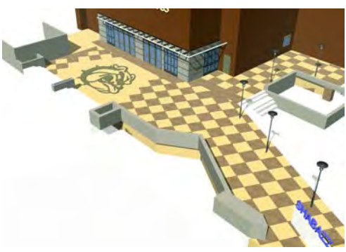
Arieal View of Sidewalk Design