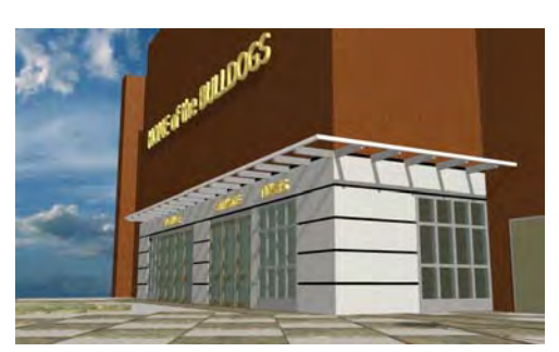
New Gymnasium Entrance