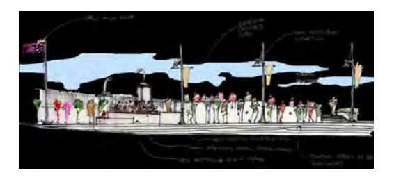
Conceptual Design of New Sidewalk Entrance

The building alterations and renovations included the addition of a new gymnasium lobby. The lobby was designed to increase security and provide a formal ticketing and security office. The existing lobby was redesigned to include a concession and athletic furniture. The exterior of the entrance is designed to increase the overall building character and mark the entrance as the "Home of the Bulldogs."