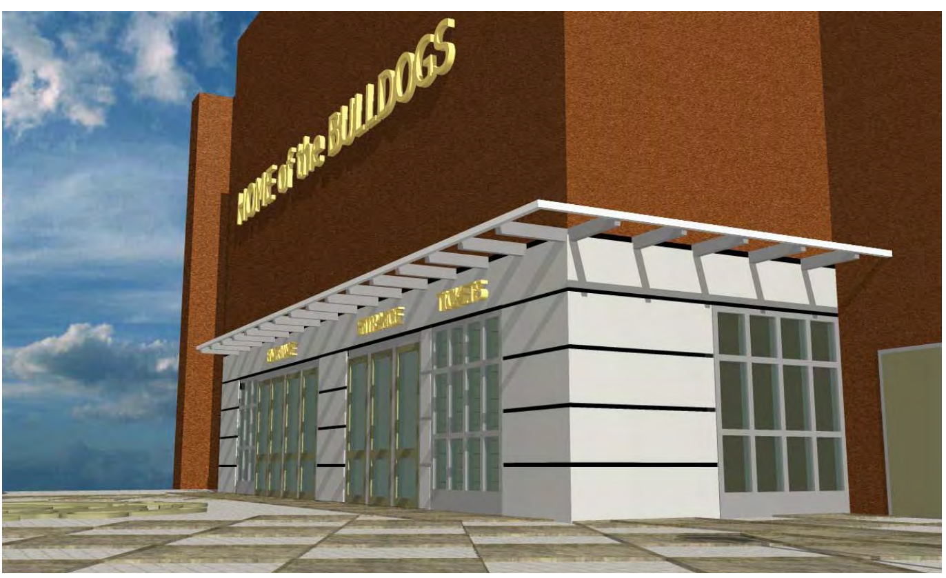
New Gymnasium Entrance