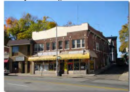
Existing Building Condition