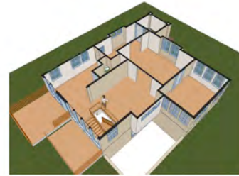
Main Level Design